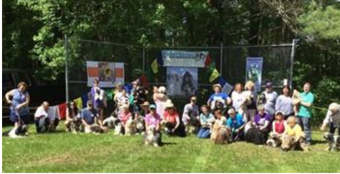
Bay Colony Tibetan Terrier Club Jamboree 2019